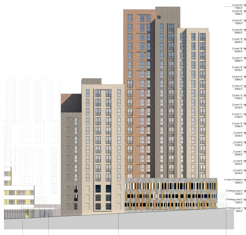
Block C - East Elevation

Previously, it was concluded that while redevelopment of the site with tall buildings would substantially change the character of the area, given the prevailing character of the town is low rise, the creation of an area with its own cluster could make a positive contribution to Worthing's skyline. Equally, while there would be a significant change to the setting of nearby listed buildings, it was not considered that such a change would necessarily be harmful as the 'clean lines' of the new development would not conflict with the 'intricate vertical features' of the listed building. It is not considered that the greater vertical emphasis of the proposed development would cause harm to the setting of the listed buildings, therefore.