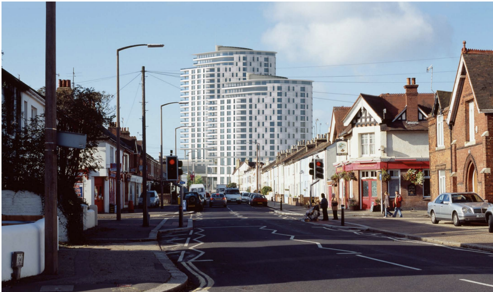
Looking East from Teville Road