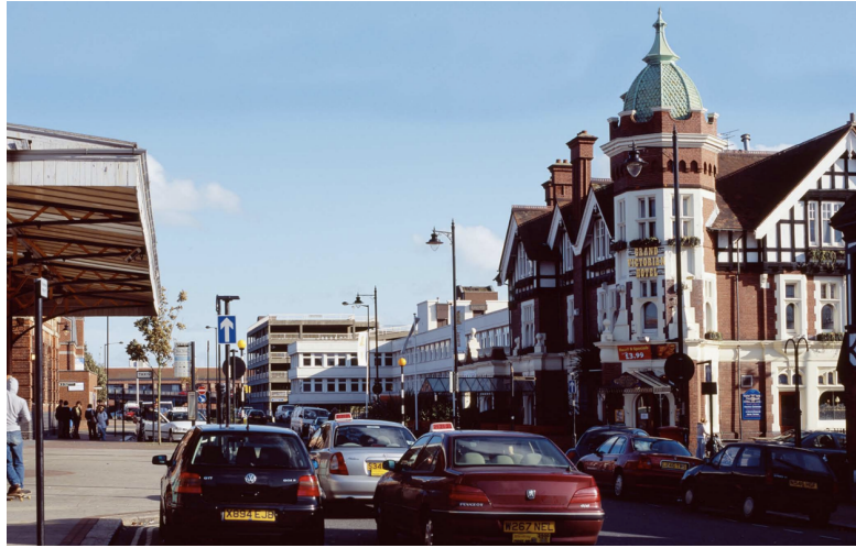
Looking North from the Pier