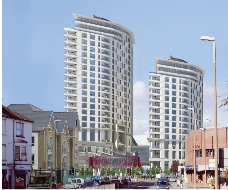
Looking West from Newlands Road