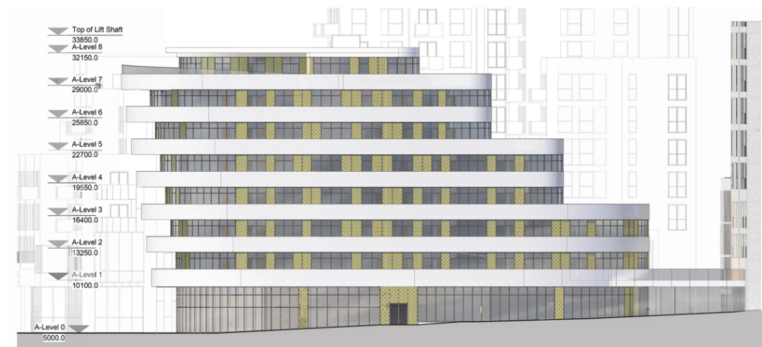
Block A - East Elevation

Blocks B and C by contrast, therefore, attempt to create a strong vertical emphasis which was not as apparent in the previous scheme when viewed from the east and west. Because of the width of the blocks vary, it is intended that the buildings appear as a cluster. The approach to these blocks is described as The palette would be derived from local influence, such as complementing tones of buff, red and grey brick. The façade materials would identify key parts of the massing, working with bay and recess geometry to breakdown the proposed development into vertical elements. This architectural approach helps in the creation of more slender forms.