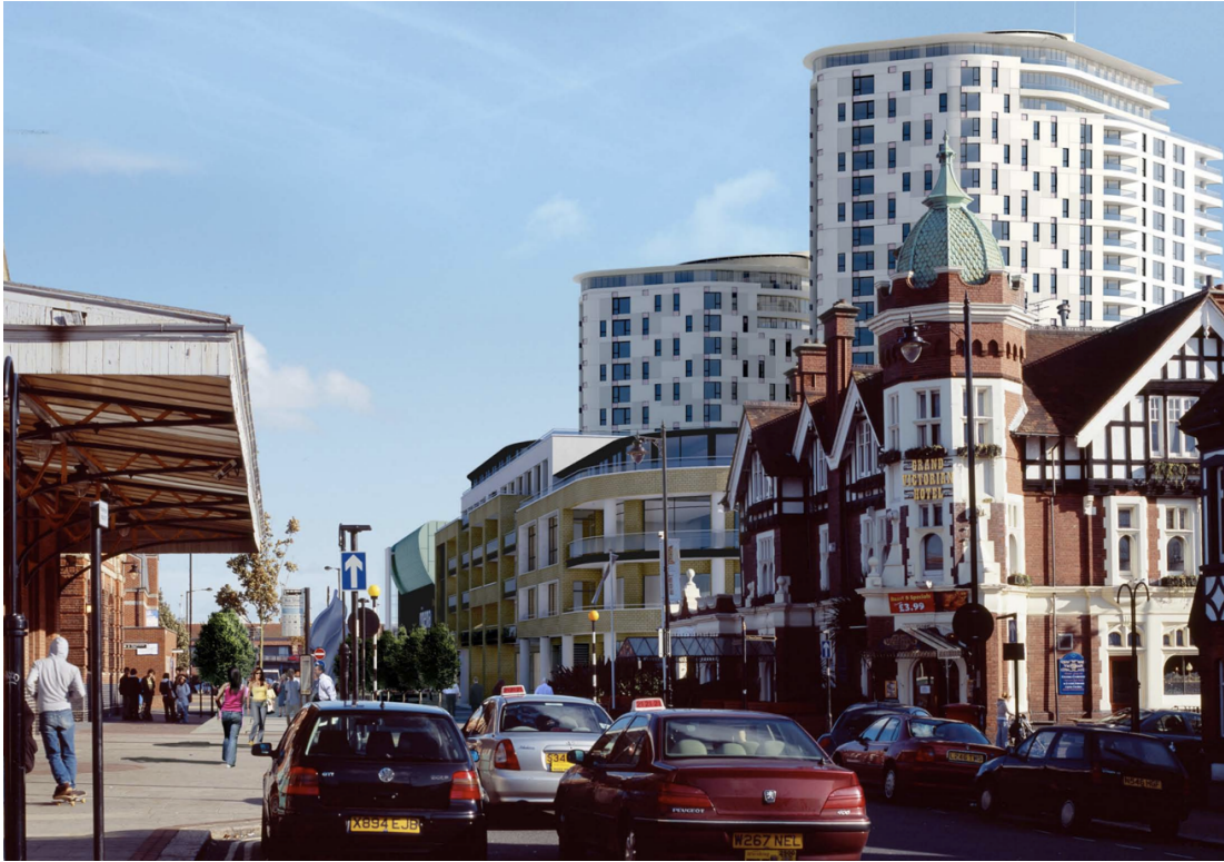
Looking Northwards from Chapel Road