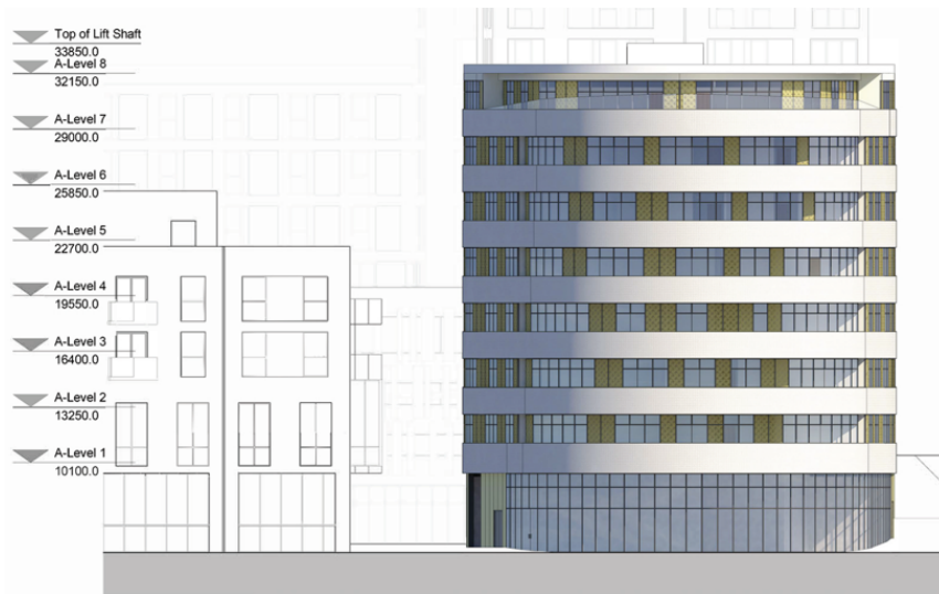
Block A - South Elevation