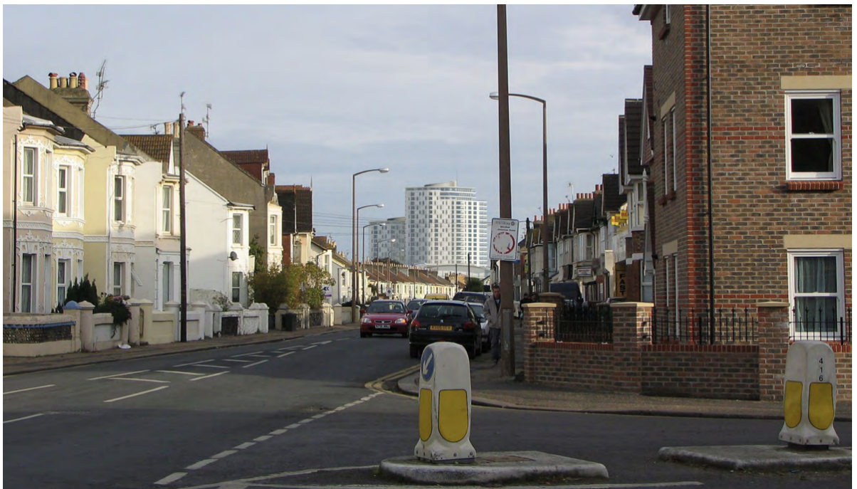
Looking South from Broadwater